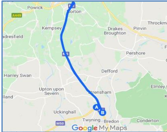
M50 to M5 southbound diversion